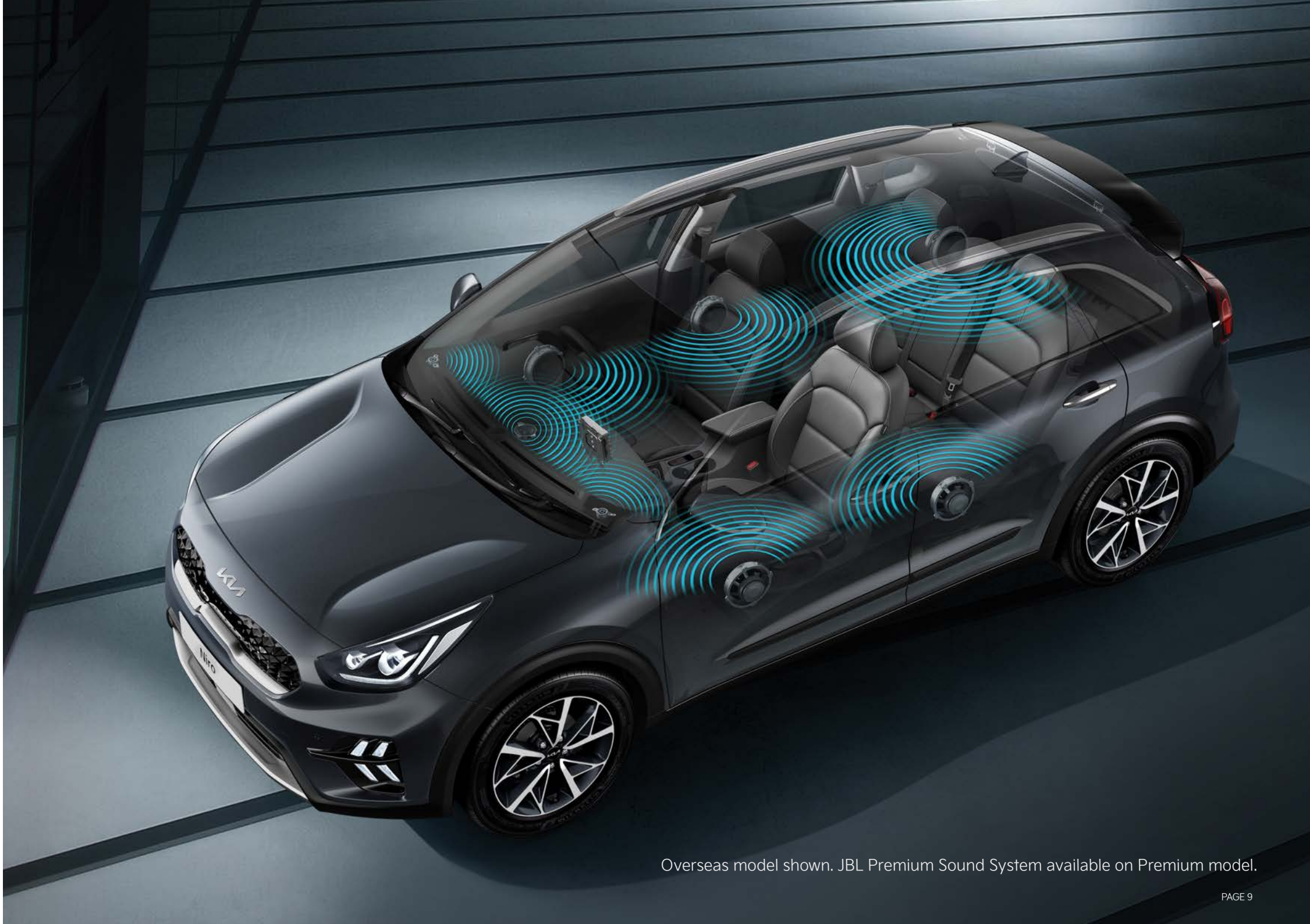
Overseas model shown. JBL Premium Sound System available on Premium model.

In Premium models the front seats are heated and ventilated. These even cool down automatically if the temperature reaches an unsafe level. Drivers get a power memory seat, while privacy glass features in the rear.