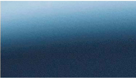
Deep Cerulean Blue