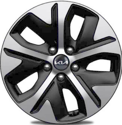
17" WHEELS (Available on EV models only)