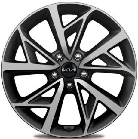
18" WHEELS (Available on HEV Deluxe & Premium models only)