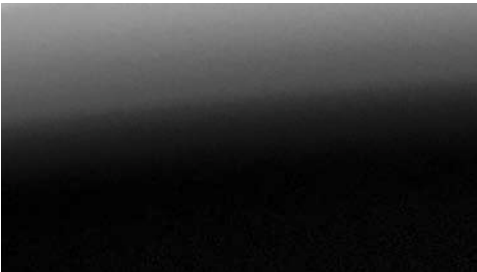
Aurora Black Pearl