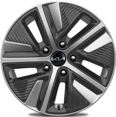
16" WHEELS (Available on HEV LX & LX Plus models, and all PHEV models)