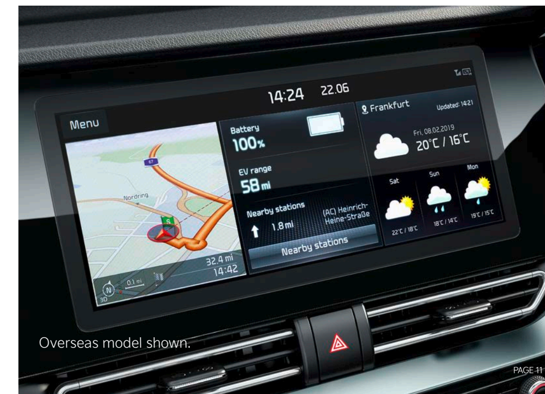
Overseas model shown.