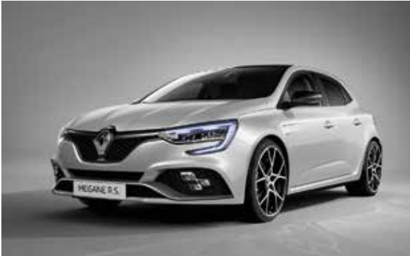
Highland Grey (1)