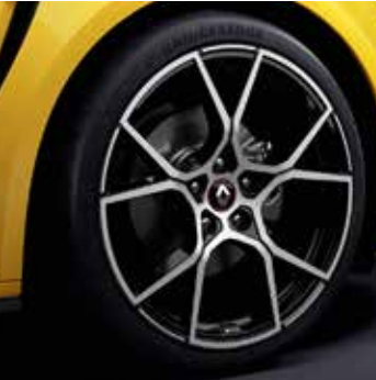
19" Fuji Light R.S. Trophy Optional Wheel Rims