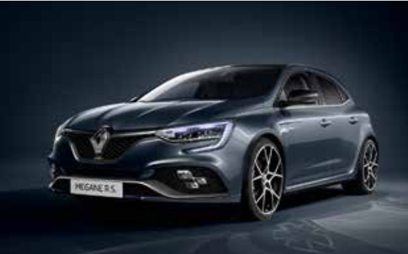
Titanium Grey (1)