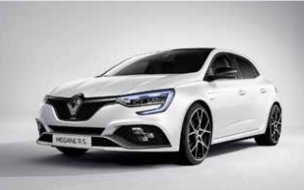
Glacier White (2)