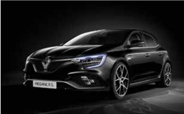
Starry Black (1)