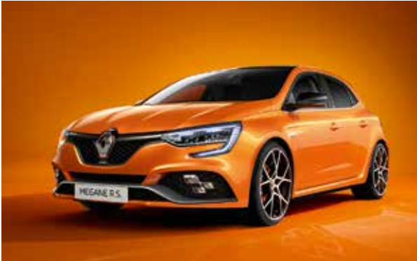
Tonic Orange (1)