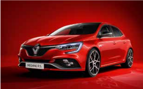
Flamme Red (1)