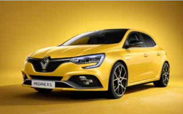
Sirius Yellow (1)