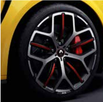
19" Jerez R.S. Trophy Wheel Rim